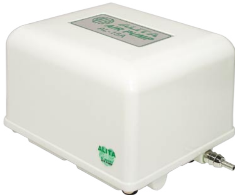
Model AL-6A AL-15A AL-20A